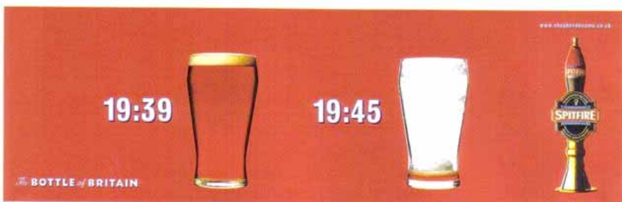
A poster ad that never saw the light of day [ Just don't mention the War – Ed ]