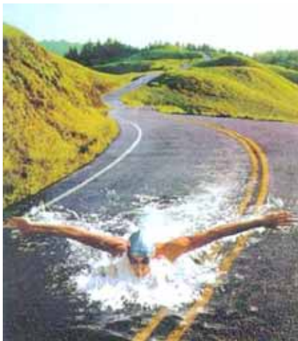
SAMmer tearing up the tarmac

got served with our lemonade, crisps, and nuts,!. (Well Hard Deck was with us!)