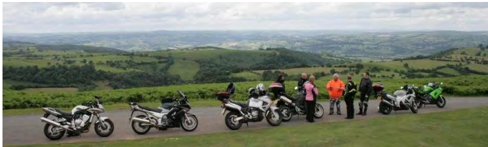
Black Mountains Group