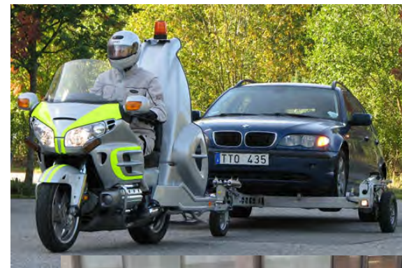
Red leader's ultimate accessory

If you don't have satnav or any idea where this is then feel free to contact any committee member who will gladly help you.