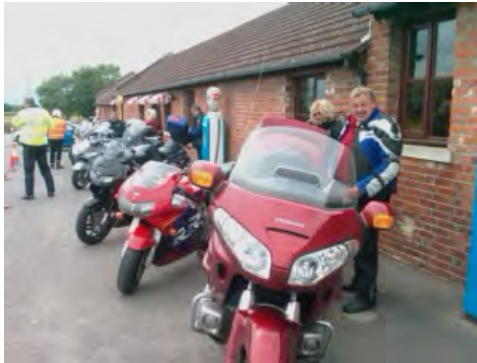
SAM arrives at Sammy Miller Museum