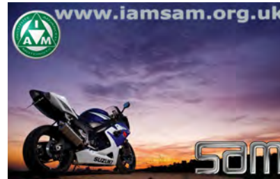
Sam Business Card

challenge everyone to pass on a couple of cards to friends / acquaintances or even just bikers you meet at the local brew stop. We have over a hundred members, so if we can get 200 cards out straight away, we hopefully can look forward to a handful of enquiries from potential recruits.