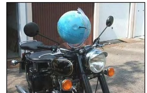
Enfield bring their bikes right up to date with a new navigation hardware