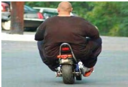
Tyre under pressure

Nearly 200 miles of cracking often traffic free roads, hopefully thoroughly enjoyed by all those behind me wondering where the hell I was going!