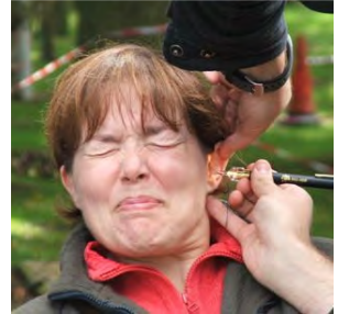
Speak no evil!!