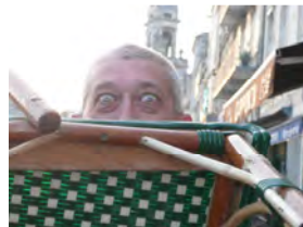
I don't want a raffle ticket!!