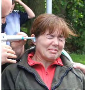
See no evil!!