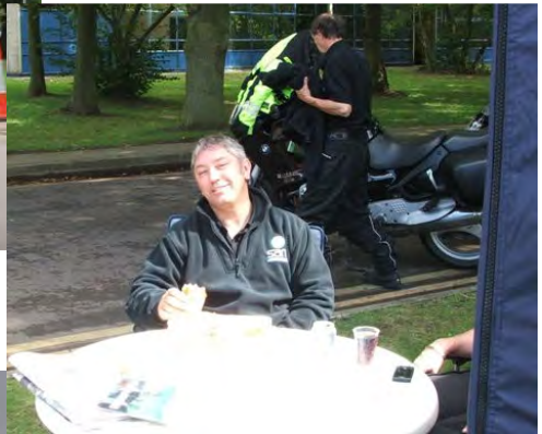
Good boy....bike found!