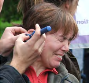
Hear no evil!!