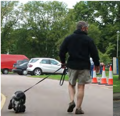
I left my bike here somewhere! Find it boy!