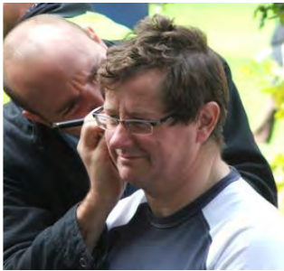
What was all the fuss about?