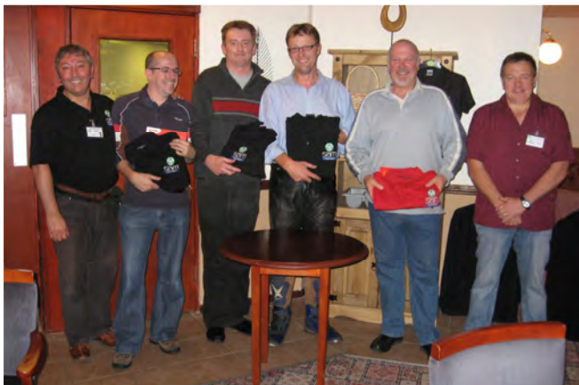
Presentation of shirts