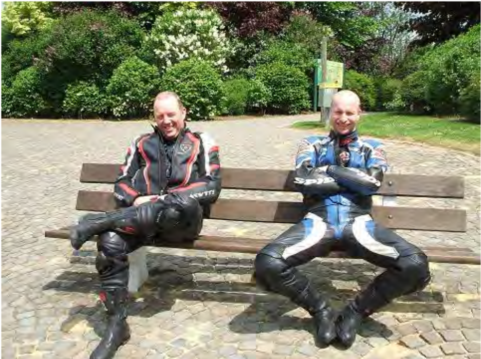
"It must have been the soup!!"

independent assessment of the safety performance of helmets sold in the UK. The SHARP RATING reflects the performance of each helmet model following a series of advanced laboratory tests and rates helmets from 1-5 stars.