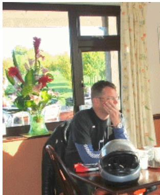
Gadget Boy struggles with Rule 2 on the Craven Arms run