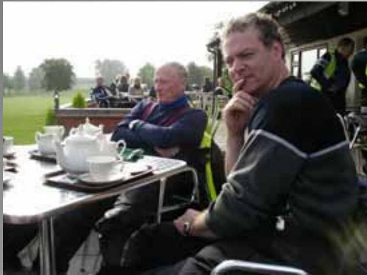
Caption competition 1