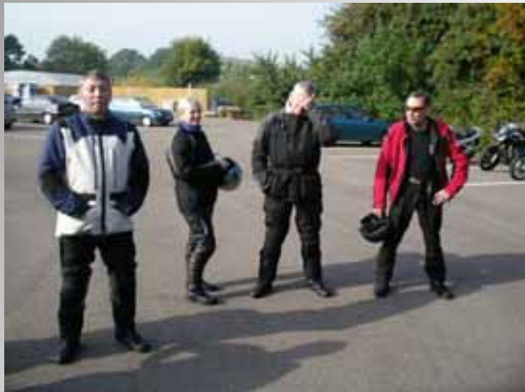
Caption competition 2