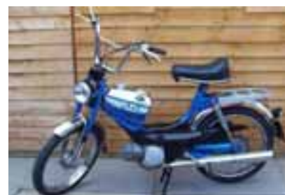
Puch: a fine marque

How long have you been riding? I have been riding for 25 years. My Grandad and Dad taught me on a Puch 3 speed. I used to race my Grandad between Stroud and Cirencester. [I bet Grandad won, and he was walking! – Ed]