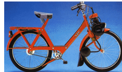
No wonder he's grumpy

It's getting towards that time of year when we look at preserving our trusty steeds so that they do not fall foul of salt corrosion. This reminds me of my first foray into the world of motorcycling. It may only have been a handed-down Mobylette moped but to me it was access to the open road.