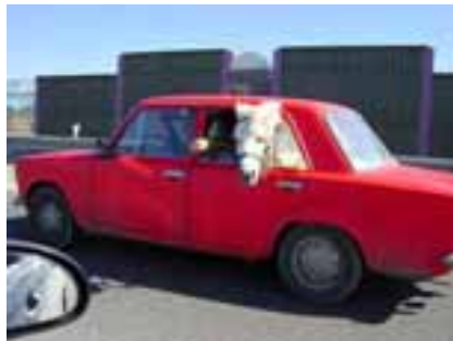
Red car with small white horse; must be a Ferrari says Eric

Thanks to ever-intrepid Eric Bush for tracking down this radical new Ferrari model being secretly road tested in Eastern Europe.