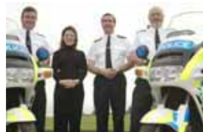
He's the big beardy one on the right

Best riding moment? Probably at work - escorting VIPs always gave