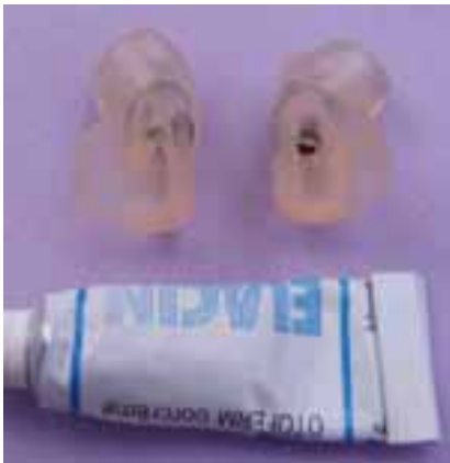
Filtered motorcycle earplugs ensure good protection at lower frequencies and allow air into the ears.

that that the ears are 'overloaded' and it's very difficult discriminate what's being said no matter how much you shout. So by keeping sound levels down, earplugs improve safety.