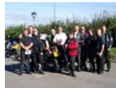
Three of these riders (on their way to DAM Busters - see p.46) own VFRs. The epitome of good taste and discernment, wot?