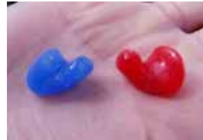
Unfiltered silicon custom earplugs fit well into the canal for easy use under a helmet. Colour coded for left & right.

The only way to reduce noise exposure for motorcyclists is the use of efficient earplugs. These must provide protection, be comfortable for long periods of use and fit deep