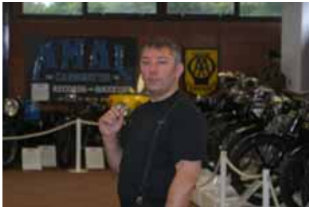
When I first saw the regalia, my right arm locked, like this...