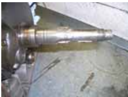
The offending crank journal

Riding to work one Sunday – 60 mph (honestly!), the flywheel retaining nut came undone allowing the alternator rotor to come adrift, which chewed the splines on the crankshaft rendering the crank useless (a common problem on the 916's).