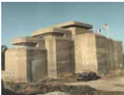
The Blockhouse at Batz

Batz has three beaches, plenty of rock pools and a small harbour. We explored the town in the morning after petit déjeuner then followed the locals' tradition of stopping for a splendid lunch. A swim was the order of the afternoon after a quiet rest on the beach.